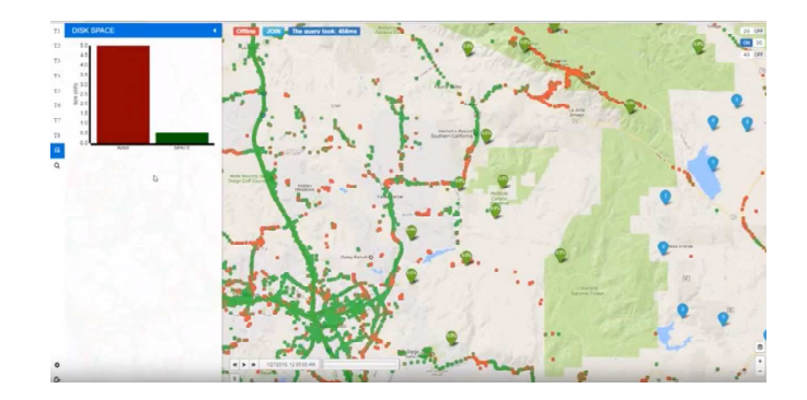
Fig. 2. The TBD-DP operator enables a visual exploration interface of our SPATE architecture to retain a high resolution in the data exploration functionality without consuming enormous amounts of storage.

We have extended SPATE [2], a novel SPARK-based processing architecture with HDFS and an RDBMS for catalog management, in order to integrate our TBD-DP operator. The proposed architecture comprises of three layers (see Figure 2), namely Storage Layer, Indexing Layer and Application Layer. The Storage layer uses the TBD-DP operator in order to provide the decay methods for the Indexing Layer. The Application Layer uses the index to retrieve the decayed data and consists of a web-based user interface in HTML5/CSS3 along with extensive AngularJS. An illustrative network exploration interface is shown in Figure 2. The TBD-DP has been implemented using Tensorflow over HDFS in Python. We have implemented a query sidebar that allows the user to execute a variety of snapshot queries and recurring queries (in the form of a time-machine) for drop calls and downflux/upflux, heatmap statistics and settings. For each query the accuracy of the results will be visualized using fancy charts using the web interface. The hardware stack of our installation resides on our laboratory DMSL datacenter and interaction will be